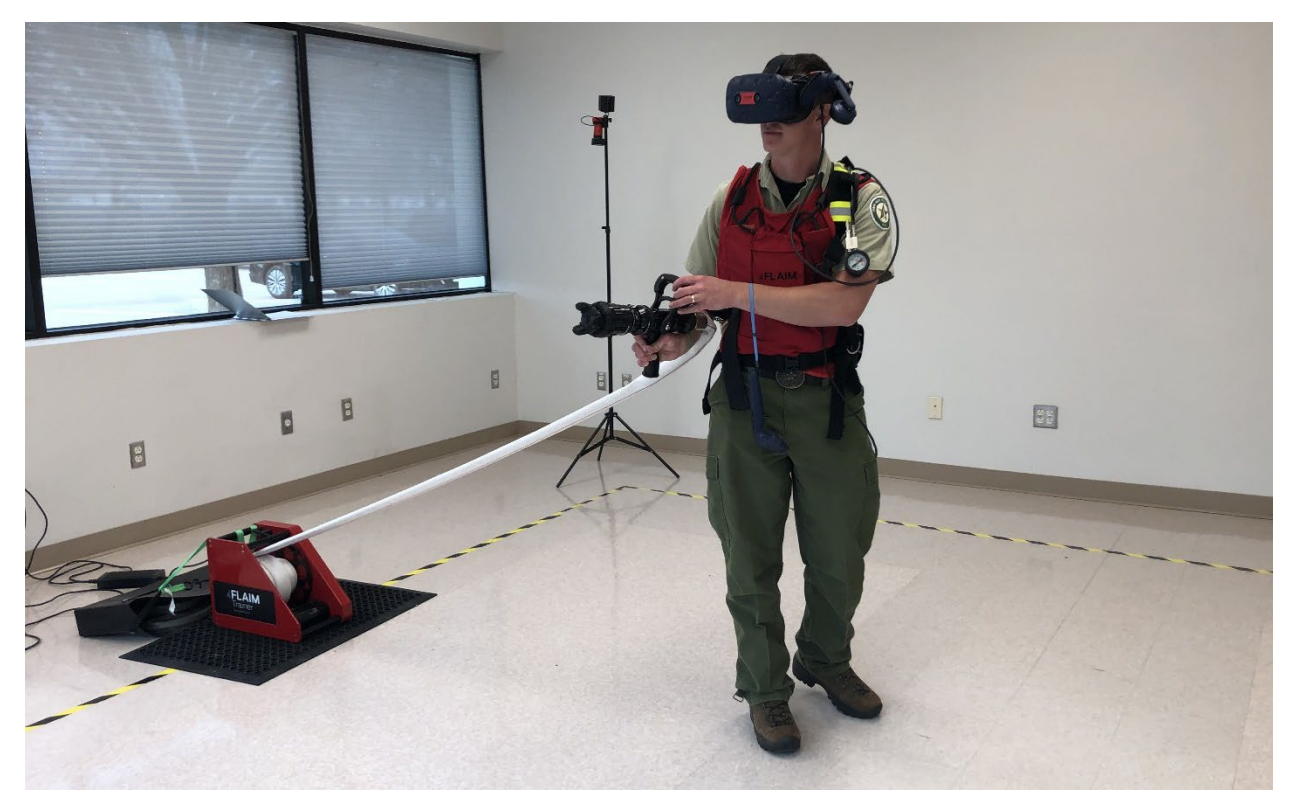
Figure 8: Wildland Firefighter in an Active Scenario