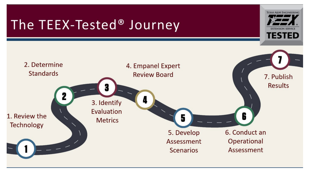
Figure 4: A Graphic Representation of the TEEX-Tested Protocol

<u>Step 2 – Determine Standards:</u> The TT&IC team determined the standards by which the product would be evaluated and identified applicable evaluation metrics that would allow proper analysis of the technology to be tested. No National Fire Protection Association (NFPA) standards have been developed for VR pending the U.S. Department of Homeland Security/Federal Emergency Management Agency's (DHS/FEMA) Fire Protection Research Foundation project currently underway. A review of Healthcare Simulation Standards of Best Practice (INACSL Standards Committee et al., 2021) was conducted to understand possible similar standards for VR training.