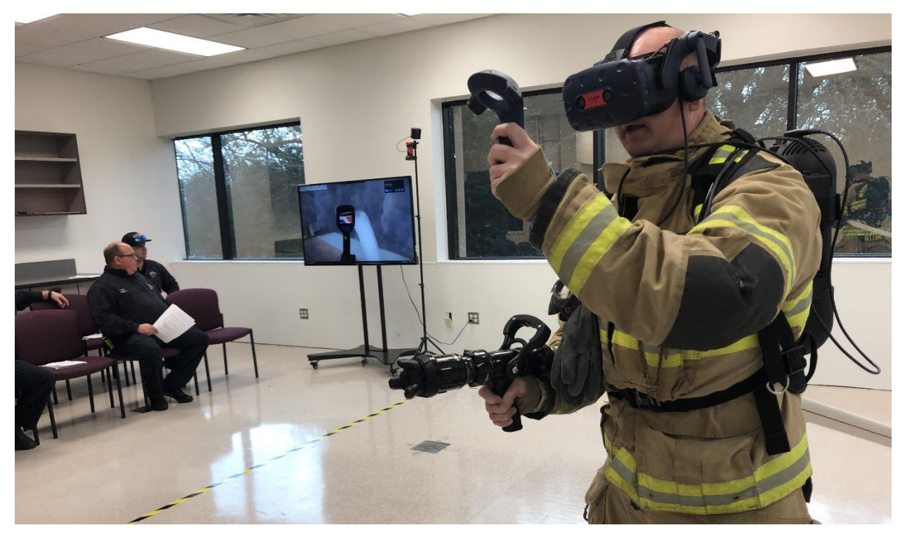
Figure 7: A Municipal Firefighter Using the Simulated TIC