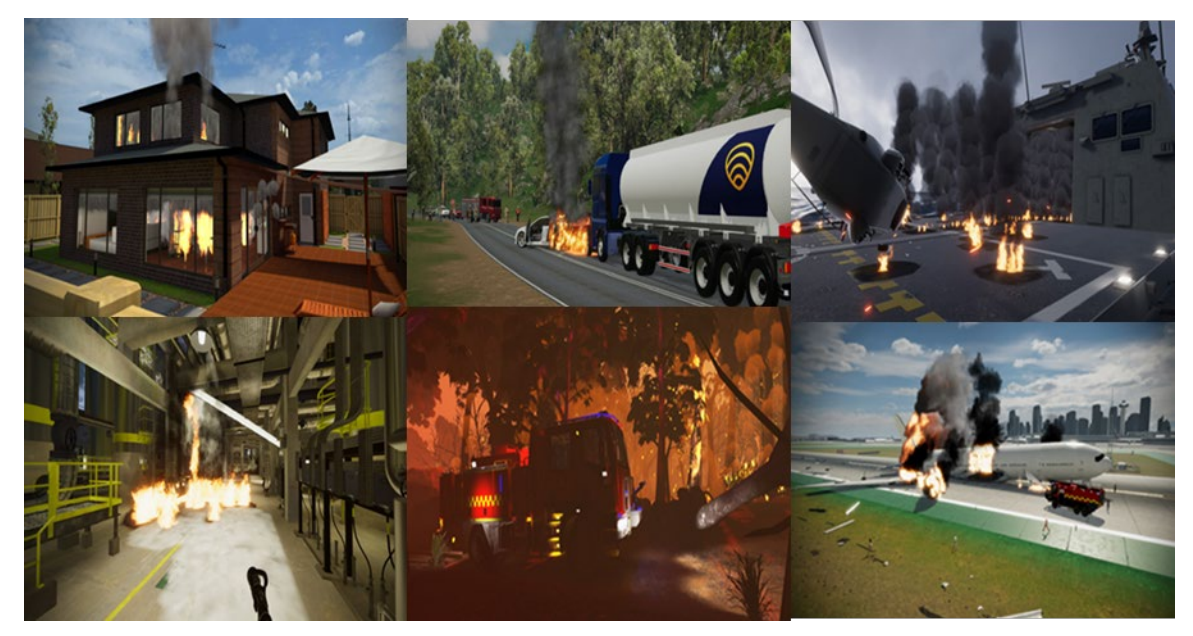
Figure 2: Representative Depictions of the Six Virtual Environments

Table 1: Scenario Organized by Environment and Type