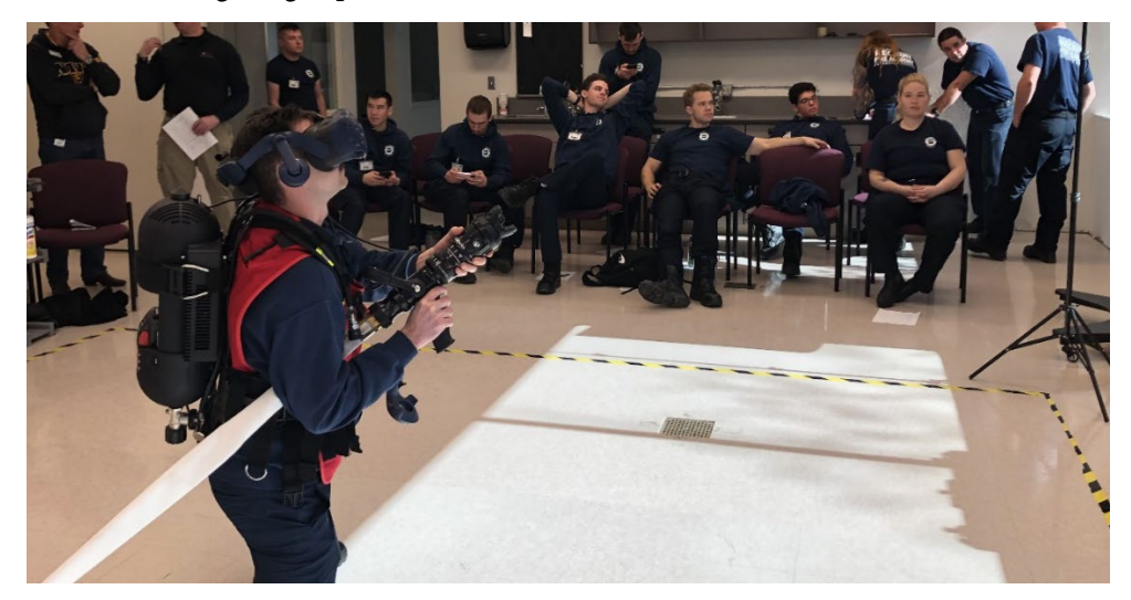
Figure 6: Cadet Firefighter Using FLAIM

of real-world experience with firefighting. Their expectations regarding how the system and equipment operated were mixed due to experiencing the fire-fighting components for the first time and frustrations with learning how to teleport in scenarios. All considered the resolution to be good and did not detect any latency or tracking issues. All felt immersed in the scenarios and found them to be realistic. Everyone indicated they did learn from the VR experience, and many felt the instructor's facilitation was the most important part of the learning process. The students felt the variety of scenarios and training objectives were good and saw a valid use for training all levels of firefighter, but especially experienced firefighters who have real-world firefighting experience.