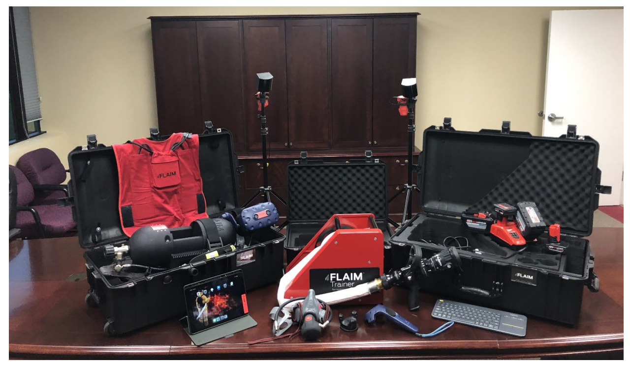
Figure 1: FLAIM System Hardware Components