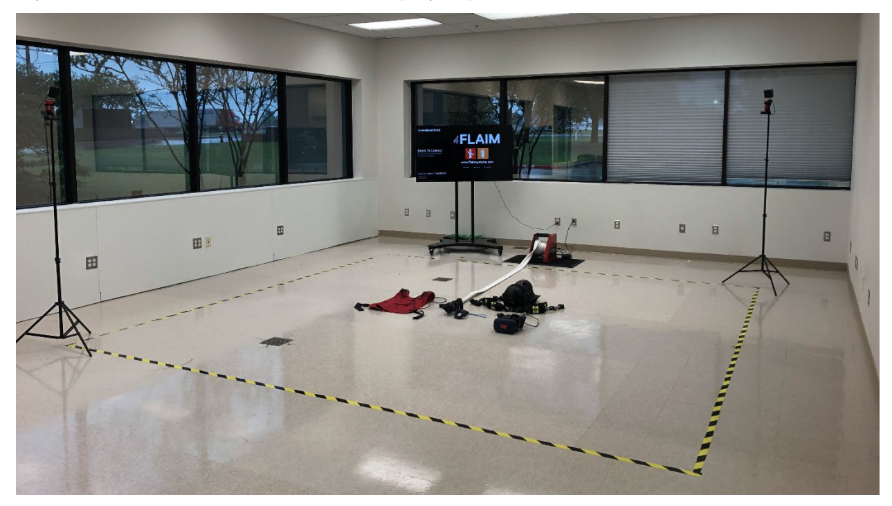
Figure 3: Photo of the TT&IC Room Setup

Setup of the FLAIM Trainer system requires a space of at least 10 ft \times 10 ft (recommended 15 ft \times 15 ft). The system requires four separate 120-volt electrical receptacles for operation. Standard room setup involves placing the VR trackers (on provided tripods) diagonally across from each other in the corners of the designated training floor space. To allow for proper room calibration, the SCBA and VR headset is placed in the center of the room facing the twelve o'clock position with the hose reel at the six o'clock position as shown in Figure 3. Room calibration is required when the system is installed in a new location or if the VR trackers are moved. Calibration is a simple nine-step guided procedure requiring the wireless keyboard and television screen to follow the step-by-step instructions.