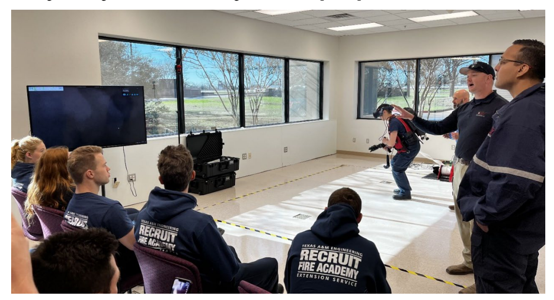
Figure 5: Fire Academy Instructors and Recruits Observing a Scenario

The fire academy instructors reported some previous experience with VR technology. Based on that previous experience, they considered the resolution to be good but detected some latency and tracking issues. However, they indicated the FLAIM Trainer system and equipment did operate and perform as they expected. All the instructors indicated they did feel immersed in the scenarios and found them to be realistic. Also, they thought there was a good variety of scenarios offered and each had sufficient sub events and valid training objectives. All indicated they did learn from the VR experience and saw a valid use for the FLAIM Trainer for initial, refresher, and advanced firefighter training. Also, they agreed upon its value for volunteer and full-time firefighters as well as for recruiting. As instructors, they all agreed the system is easy to operate and teach from and felt the post-training metric checklists were sufficient. They noted the value of the option to add additional customized learning outcomes at the conclusion of scenarios. Figure 8 show various stages of scenario participation.